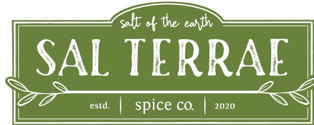
Knock Out Italian