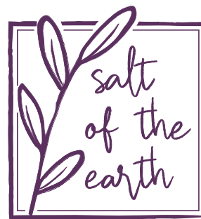
One Color House