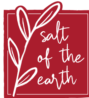
Knock Out Inferno