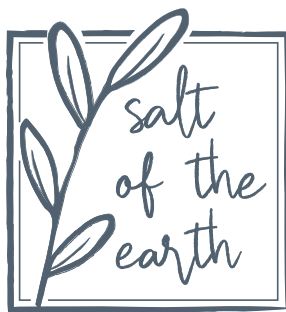
One Color Beach