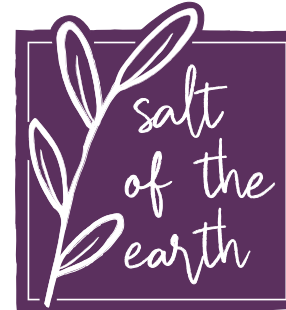
Knock Out House