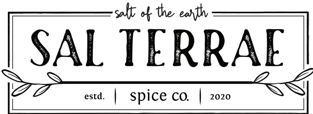
One Color Black