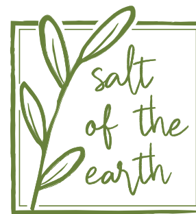
One Color Italian