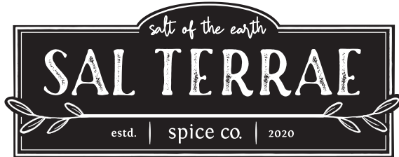
Knock Out Black