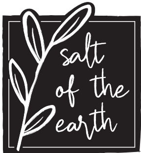
Knock Out Black