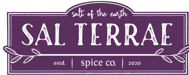
Knock Out House