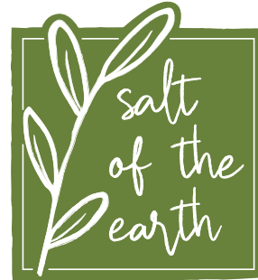
Knock Out Italian