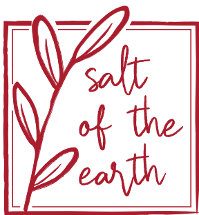
One Color Inferno